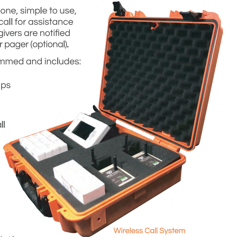
Wireless Call System Part#: 30152033