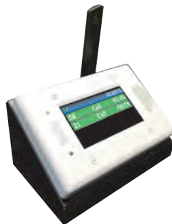
Desktop Digital Call Display